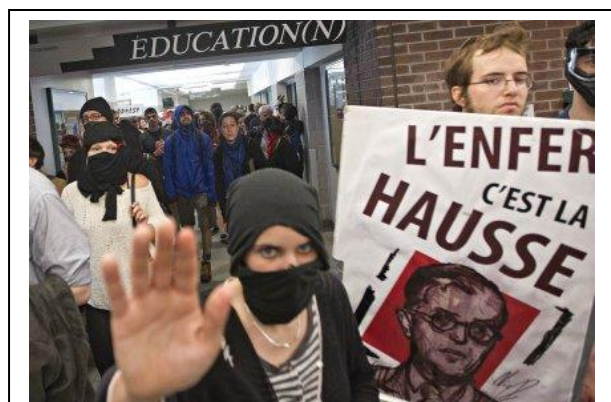
Demonstration: 'printemps érable' (maple spring) at l'UQAM